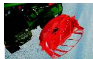
metal grid wheels, special CaneThumper attachment for operating on steep slopes