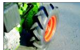
single tyres, standard CaneThumper execution for usage in flat and light slopy areas